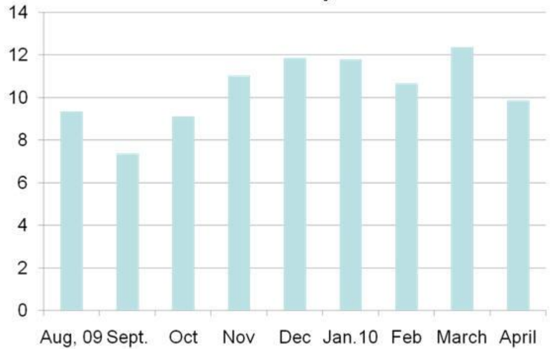
Total Solid (Fat & SNF%) of MiIK